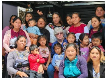
Cooperative members April 2024

Donations may be given through our website or by mail to: Mujeres De Maiz Opportunity Foundation, P.O. Box 1954, Sequim, WA 98382